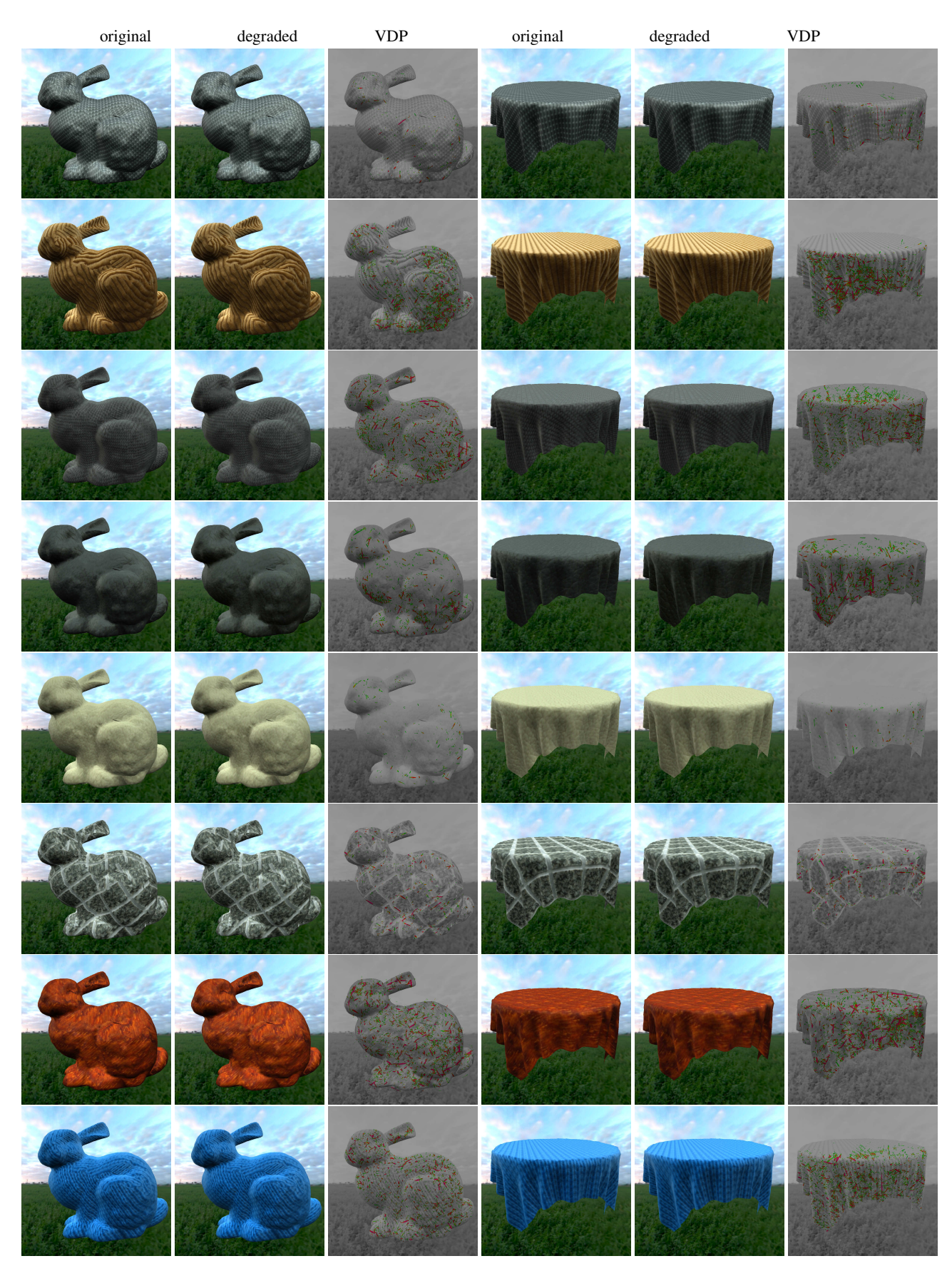
Figure 6: Renderings of degraded images visually equivalent with original BTF grassplain and two objects bunny (first column) tablecloth (second column) environment for all tested samples. Corresponding visual difference predictor result is shown in third column, respectively.